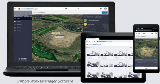
Trimble WorksManager Software

Build to the same design across your fleet, create in-field designs and updates on the fly and export them from Siteworks to Trimble WorksManager Software to use in machines on site equipped with Trimble Earthworks Grade Control Platform.